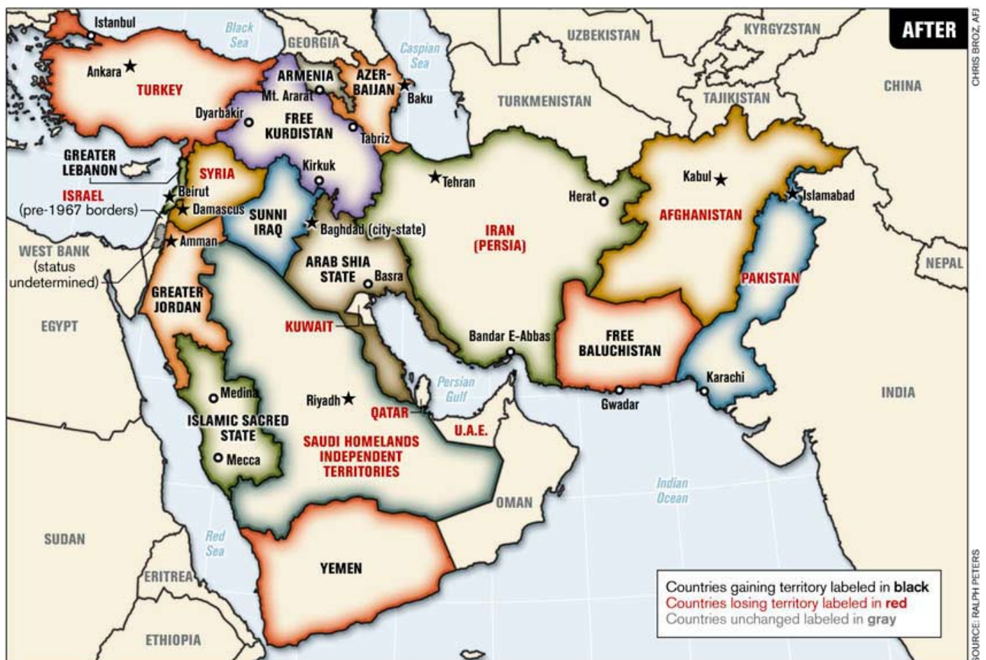
Source: Ralph Peters, Blood Borders: How a better Middle East would look , in: Armed Forces Journal (June 2006)

In this context, the accusation of Iran as being a sponsor of anti-American attacks in Iraq 27 will serve, along with the harsh criticism of its atomic program, as a pretext to attack the country. The blueprint for such a scenario has been described by Zbigniew Brzezinski, one of the most renowned geopolitical thinkers, in a hearing before the Senate Foreign Relations Committee: “If the United States continues to be bogged down in a protracted bloody involvement in Iraq, the final destination on this downhill track is likely to be a head-on conflict with Iran and with much of the world of Islam at large. A plausible scenario for a military collision with Iran